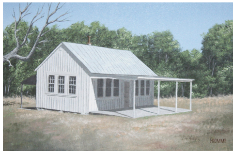
Wrede School 3828 S. State Highway 16