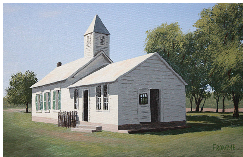
Lower South Grape Creek School 10273 E. US Highway 290