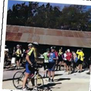
Cave Creek School Pavilion 1932-1933

Looking for a cycling route? One that meets your needs of: