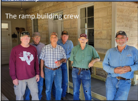
The ramp building crew

THEY OFFERED AND WE ACCEPTED. OUR COST WAS THE MATERIAL USED AND THEY DONATED THE LABOR. THANKS TO THE GUYS WHO BUILT THE RAMP. WHAT A BLESSING!