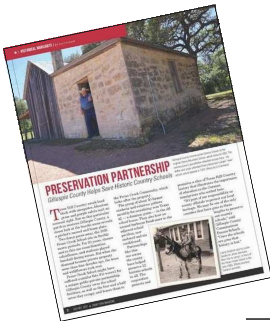
Page 10-12 Vol 29, No 5 Sep./Oct. 2017 County , A Publication of the Texas Association of Counties

To preserve history to enhance the future.