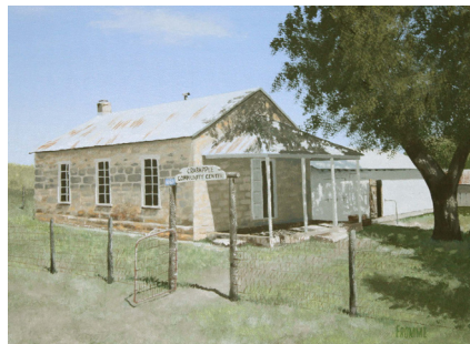
Crabapple School 14671 Lower Crabapple Rd.