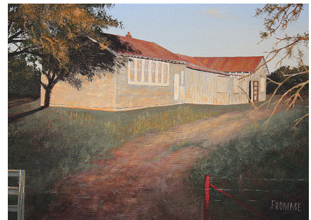
Pecan Creek School 3410 Pecan Creek Rd.