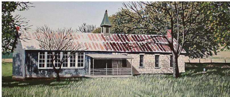
Williams Creek (Albert) School 5501 S. Ranch Road 1623