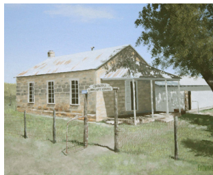
Crabapple School 14671 Lower Crabapple Road

Grass Identification Activities: Learn About Native Grasses and Invasive Weeds.