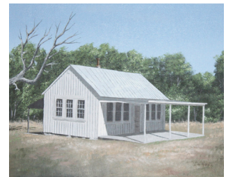
Wrede School 3828 S. State Highway 16

Join in Playing Various Card and Domino Games. Beginners Welcome!