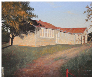
Pecan Creek School 3410 Pecan Creek Road

Tour Refurbished Teacherage. Hear the History of a Teacher's Living Arrangements.