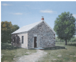
Cherry Spring School 5973 Ranch Road 2323

Grass Identification Activities: Learn About Native Grasses and Invasive Weeds.