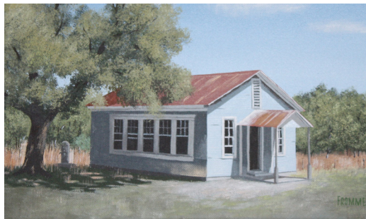
Nebgen School 1718 North Grape Creek Road

Open House Activity: Former students will feature rocks on display. Docents will speak German with emphasis on verses and wise sayings.