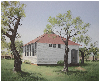
Meusebach Creek School 515 Kuhlmann Road

Historic Maps. More than just a location. Former students will conduct a map study. We will have historic maps on display, some of which were used at the former Meusebach Creek School prior to 1954. Maps provide a lot of other information besides just location. Come see.