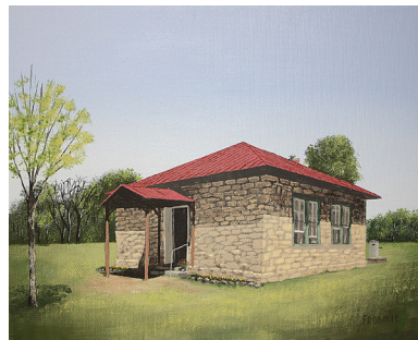
Grapetown School 7325 Old San Antonio Road

Visitors will see the preserved school- house, see a selection of textbooks used by students of one-room schools, and peruse a collection of photo- graphs of students and teachers. Descrip- tions of instruction, discipline, lunch items, student dress, and transportation can be read as visitors walk between the desks.