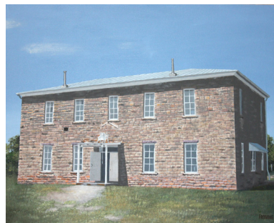
Willow City School 2501 Ranch Road 1323

Wildflower Time— Come and learn how to press flowers as our ancestors did. Either bring along a flower or find one at the school. Learn the common Texas wildflowers. See a local student's botany/biology handmade notebook c.1920-1924. Take home your pressed flower.