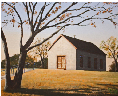
Junction School 144 State Park Road 49

Visitors will be able to sit in the old desks and write on slate boards. Park staff will interpret the story of President Johnson's deep connection to public education.