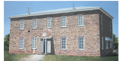
Willow City School

Come learn about the German Easter traditions of decorating eggs with natural dyes and fresh grass Easter baskets. Then try a piece of the traditional Easter Lamb Cake.