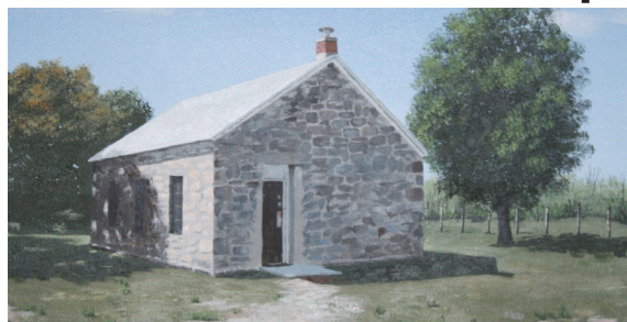
Cherry Spring School 5973 Ranch Road 2323

All are invited to tour the one room school property and learn from the Frontier History Company Foundation members providing information on the Texas cattle drives and early Texas Ranger History.